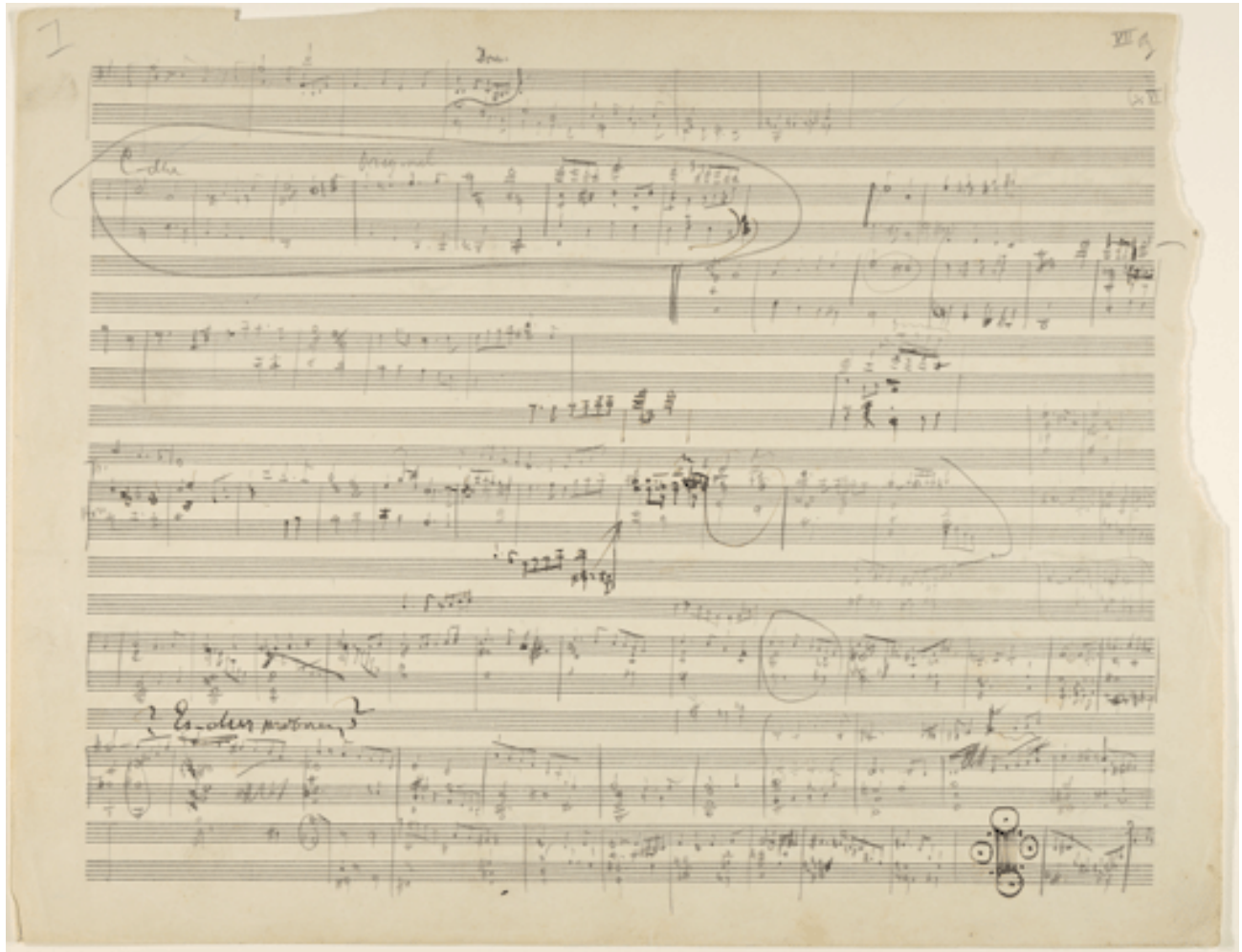
Illustration 1 (leaf 1, verso)

Moldenhauer-Sammlungen in der Bayerischen Staatsbibliothek München, Mus. ms. 22741